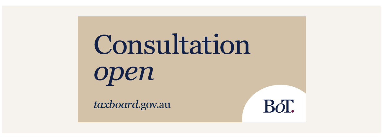
Image: a graphic for a Consultation open announcement for the Board of Taxation.

During the course of a review the Board will canvass stakeholder views to inform its work. Upon commencement, the Board publishes a consultation paper seeking feedback from a broad cross section of stakeholders to help inform its views on the particular terms of reference. Consultation papers are published on the Board's website and promoted through the Board's social media platforms, LinkedIn and X. The Board seeks feedback through written submissions as well as through roundtable meetings, which are open to all interested stakeholders.