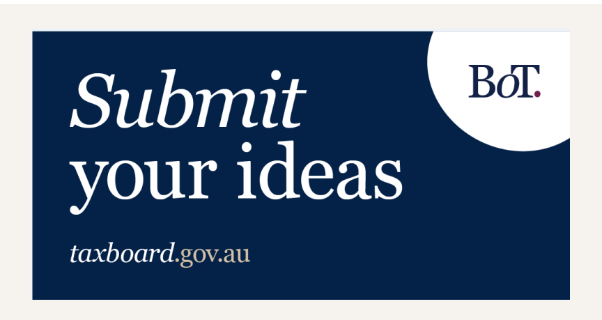
Image: a graphic inviting people to Submit your ideas to the Board of Taxation.

The Board invites contributions from stakeholders through Sounding Board +, a web-based collaborative platform where stakeholders from the broader community can submit ideas to improve the Australian taxation system.<sup>4</sup> At each of the regular Board meetings, the Board looks at all new ideas posted to Sounding Board +. Where suitable, the Board will advocate a pathway for their implementation via legislative or administrative means.